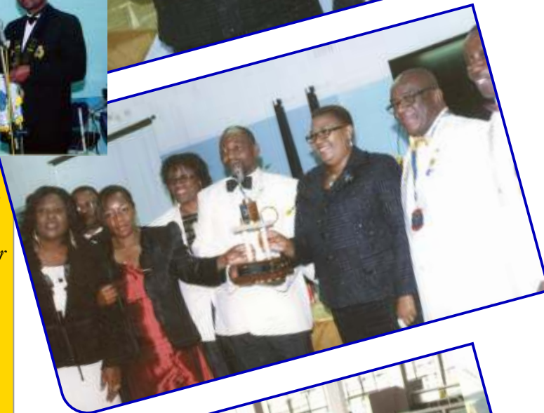
New Lion Thokozani Khupe (Zimbabwe Deputy Prime Minister) shares moments of joy with Lion Caleb Jera who had won a floating trophy as other Lions joined in the celebration.