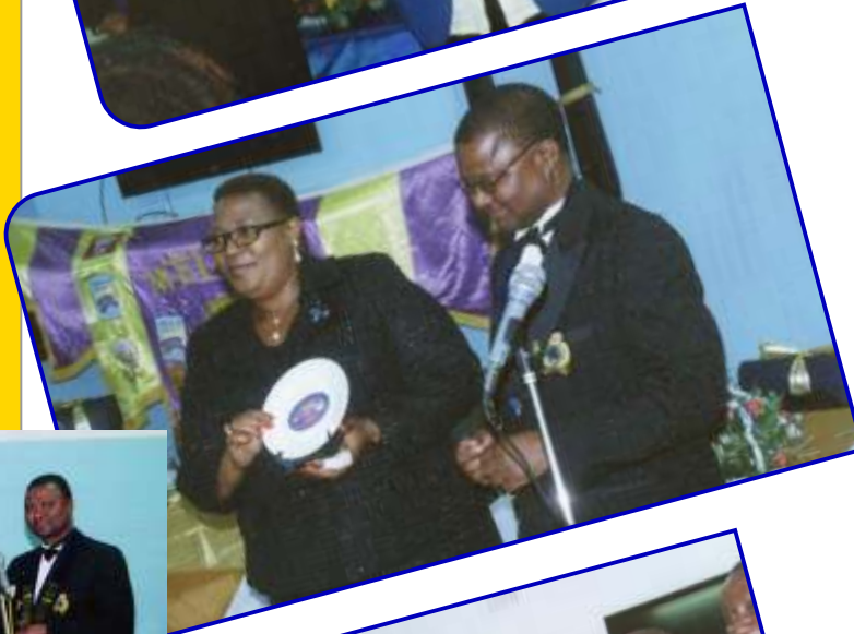
District Governor Clement Ndala poses for a photograph after Zimbabwe Deputy Prime Minister Thokozani Khupe was inducted a Lion at the Kwekwe Jubilee Celebrations.