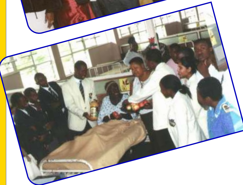
Leos and students of Goldridge College took time to visit Kwekwe General Hospital where they donated blankets, linen & fruit to patients.