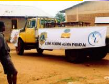
The Reading Action Programme truck donned with the RAP banners on the side and front.